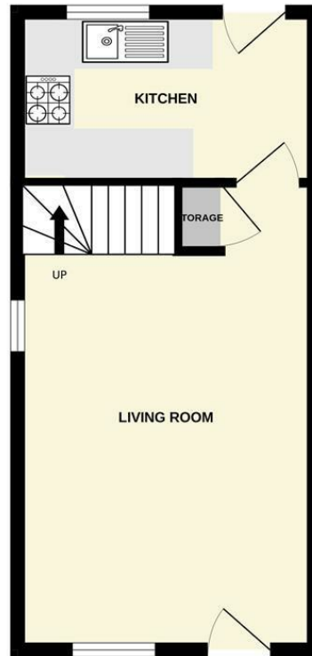
GROUND FLOOR 302 sq.ft. (28.1 sq.m.) approx.